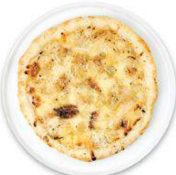
ROASTED GARLIC AND CARAMELIZED ONION PIZZA Roasted garlic, caramelized onions, mozzarella, and parmesan on white sauce. 313