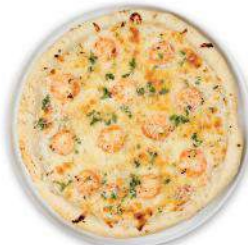
SHRIMP AND GARLIC PIZZA White sauce pizza topped with shrimp, roasted garlic, mozzarella, and parmesan. 483