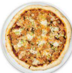
BUFFALO CHICKEN PIZZA Chopped crispy chicken tossed in hot sauce, diced celery, mozzarella, and drizzled with bleu cheese sauce. 373