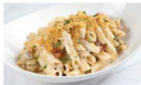
MAC 'N' CHEESE WITH BACON Penne pasta loaded with cheese and topped with bacon and a buttery bread topping. 322