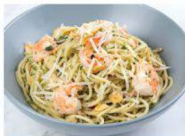
SHRIMP AGLIO OLIO Shrimp and garlic sautéed 'til fragrant tossed in pasta and topped with parmesan. 472