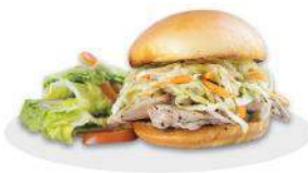
GRILLED CHICKEN BURGER Two grilled chicken breast filets, topped with a vinegary slaw. 403