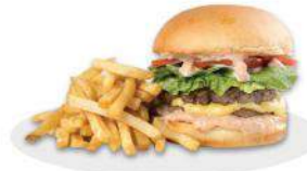
CALIFORNIA BURGER Two seared beef patties topped with cheddar and smeared with our own secret sauce. 448

ALL SERVED ON TOASTED, HOUSE-MADE BUTTERY BUNS WITH A SIDE OF FRIES.