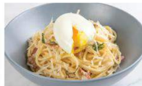
CARBONARA Spaghetti carbonara with bacon and parmesan and topped with a 6-minute egg. 322