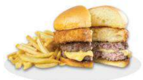
MAC 'N' CHEESE BURGER Two seared beef patties topped with cheddar and a crispy, deep-fried mac and cheese patty. 543