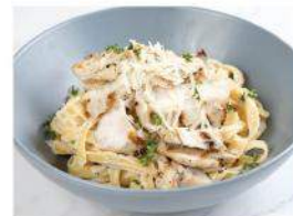
CREAMY ALFREDO WITH GRILLED CHICKEN Fettuccine tossed in a rich cream sauce, topped with strips of grilled chicken breast and parmesan. 312

Prices are inclusive of 12% VAT and subject to 10% service charge.