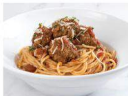
MEATBALL MARINARA House-made meatballs with herbs and spices paired with our own marinara in spaghetti topped with parmesan. 412