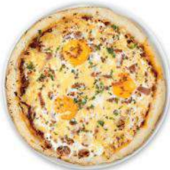
BREKKIE PIZZA Crumbled house ground pork seasoned with spices, bacon, eggs, mozzarella, and cheddar cheese with marinara. 583