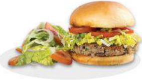
BLACK BEAN VEGGIE BURGER Black bean patty with roasted veggies and spices. 303